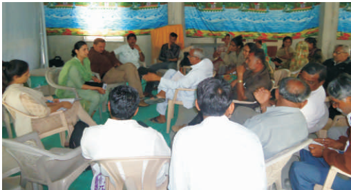
Meeting of Producer Company with FWWB