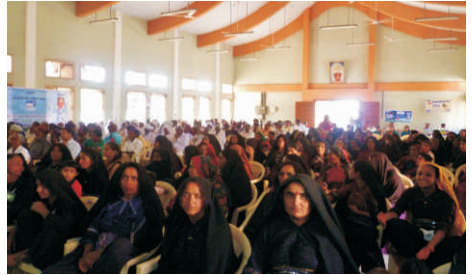
First Annual Meeting of Producer Company