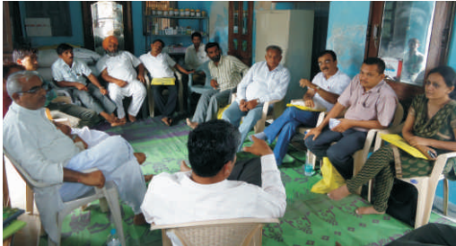
Directors' Board Meeting of Producer Company