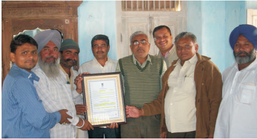
Registration day of Producer Company