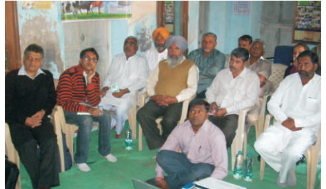
Meeting of Producer Company with NDDDB