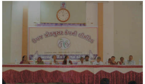
First Annual Meeting of Producer Company